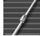
DO-204AH (DO-35 Glass)